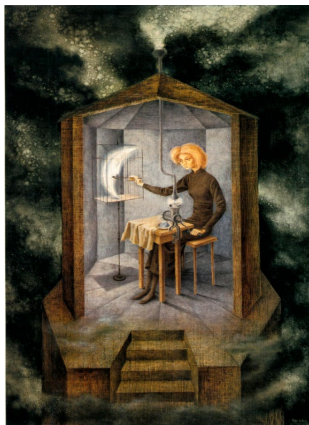
Remedios Varo, Papilla estelar (Celestial Pablum) , 1958

Paalen, Matta, Francés, and Onslow Ford developed new types of abstraction in response to local history and geology. Paalen developed an alternative theory to Breton's brand of Surrealism, followed by a series based on totemic figures seen in grand canvases such as Tropical Night (1948), that indicate the influence of both quantum physics and pre-Columbian objects accessible to him at the time. In 1941, Matta began a new series of works inspired by the country's landscape and the psychological anxiety of wartime, sensitively alluded to in Centro del agua (Center of Water) (1941), which Matta painted while visiting Paalen. Onslow Ford's ambitious painting The Luminous Land (1943), which will be shown in New York for the first time, is an abstracted interpretation of the lake and mountain setting of his home in the remote town of Erongarícuaro, centered around an erupting volcano. In Mexico, Onslow Ford admitted that his growing attachment to nature and its impact on his psyche led him away from Surrealism.