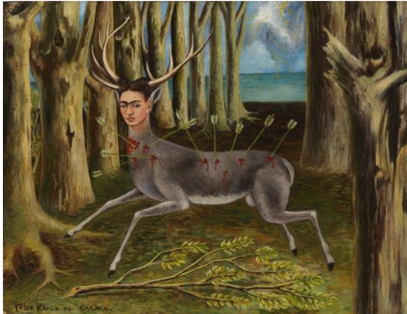
Frida Kahlo, La Venadita (The Little Deer) , 1946

Di Donna Galleries announces Surrealism in Mexico , an exhibition that explores the robust creative moment that emerged between 1940 and 1955 as an international community of artists fled World War II in Europe and settled in Mexico. There, many principles that had defined the Surrealist movement were broadened and transformed in response to a new topography, new cultures, and the experience of exile, toward the creation of radically innovative new styles. This vibrant art-historical episode was made possible through liberal ideas about collaboration, immigration, and gender roles. It is particularly relevant in the context of today's cultural and political climate, where such issues remain under intense scrutiny and debate.