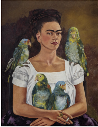
Frida Kahlo, Me and My Parrots , 1941

including her famous painting La Venadita (The Little Deer) (1946) and her commanding self-portrait Me and My Parrots (1941). Carrington, Tichenor, and Varo typically worked in illustrative styles, fusing autobiography, cosmic and ancient myths, and poetic aspects of the natural landscape in developing their own unique forms of magic realism. While the thematic sources of Carrington's work, which included alchemy, Gnosticism, shamanism, and other esoteric subjects predated her arrival in Mexico, it was there where Carrington, away from a stifling upbringing and the horrors of war, discovered the freedom to cultivate a deeply personal and codified visual language. Works such as the exquisitely rendered Les Distractions de Dagobert (1945) reveal Carrington's remarkable ability to evoke mysterious and intimate rituals. Varo similarly found creative liberation in Mexico. Her paintings often contain figures on expedition or conducting ritualistic acts among the cosmos, as in Papilla estelar (Celestial Pablum) (1958).