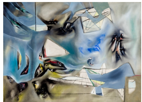
Matta, Centro del agua (Center of Water) , 1941

For artists in this exhibition who had been part of the Surrealist circle in Europe, the practice of living and making art in Mexico quickly demythified notions of the country that had been constructed across the Atlantic. The fertile art-historical moment addressed by Surrealism in Mexico comprises pictorial innovations involving both figuration and abstraction, united by investigations into the physical and unseen worlds, as artists adapted conventional Surrealist strategies to the new experience of being in Mexico. This remarkable period of expansion, in both aesthetic and conceptual terms, resulted in work that would come to define major episodes in these artists' careers, and transform notions of Surrealism beyond Europe's borders.