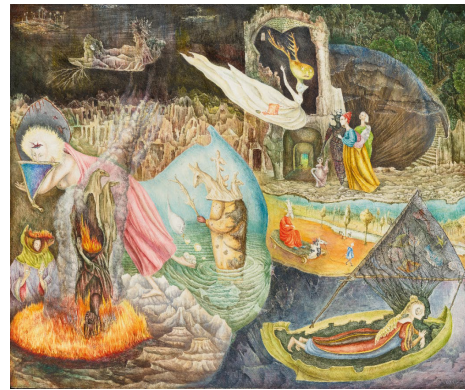
Leonora Carrington, Les Distractions de Dagobert , 1945