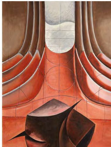
Man Ray. Macbeth . 1948.

In 1940, Man Ray fled Europe and settled in Hollywood, California, where he further focused on painting and object-making, producing accomplished and enigmatic works while becoming increasingly vocal about art and theory. Redolent with wartime anxiety, The Poet (King David) combines a bust based Michelangelo's Dying Slave . During his years in Hollywood, Man Ray also painted versions of previous works he had executed and left behind in Paris in various mediums, thus complicating the