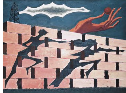
Man Ray. The Wall . 1938.

When Man Ray moved to Paris at the end of 1921, he collaborated with the Paris Dadaists and became a prominent member of the ensuing Surrealist movement, which suited his aim of destabilizing the rules of conventional painting. During this period he became well known for documentary photographs of this creative milieu and worked as a highly successful photographer in the fashion and advertising industries and in commissioned portraiture. In 1937, however, Man Ray all but abandoned photography to return to painting.