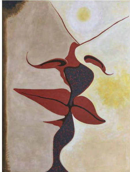
Man Ray. Image à deux faces . 1959.

Di Donna Galleries is pleased to announce the exhibition Enigma and Desire: Man Ray Paintings , on view from October 25 to December 13, 2019. The first survey exhibition to focus on Man Ray's paintings, the show will present a vibrant selection of paintings that reveals the radicality of Man Ray's thought and practice throughout his career, solidifying his historical position as a prophetic painter and theorist. The exhibition features approximately forty paintings from international museums, foundations, and distinguished private collections in Europe and the United States, as well as a selection of related works on paper.