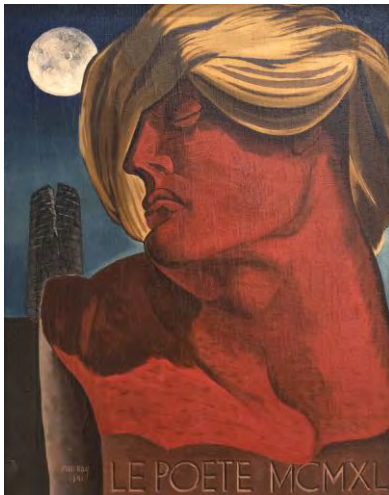
Man Ray. The Poet (King David) . 1941.

Le Chevalier rouge , 1938, combines the strategic nature of chess, a game he often played with Duchamp, with the systematic horrors of the Spanish Civil War. Each piece represents different players and victims of war-torn Spain: the pawn, representing the innocence of the civilians, is caught between two warring knights, one demonically morphed into a bright red figural image of the enemy.