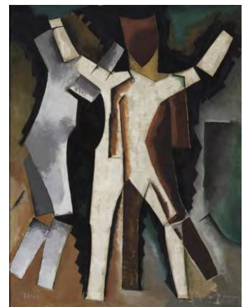
Man Ray. Dance (Dance Interpretation) . 1915.

Historically, most scholarship on Man Ray has addressed his role as a photographer and maker of Dada and Surrealist objects. His primary passion, however, was painting, and it was in this medium that he articulated his most advanced ideas as an artist. This exhibition focuses on Man Ray's prescient fascination with mechanical reproduction, temporality, and language that have had a lasting influence on subsequent generations of artists. Man Ray's relentlessly intellectual approach to art-making resulted in a dynamic painting practice that remains remarkably contemporary.